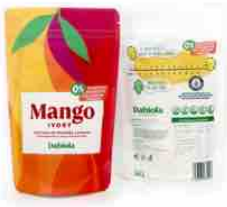
Unsweetened Dried Mango Ivory Dabiola Appearance: 100 grams Shelf Life: 12 months