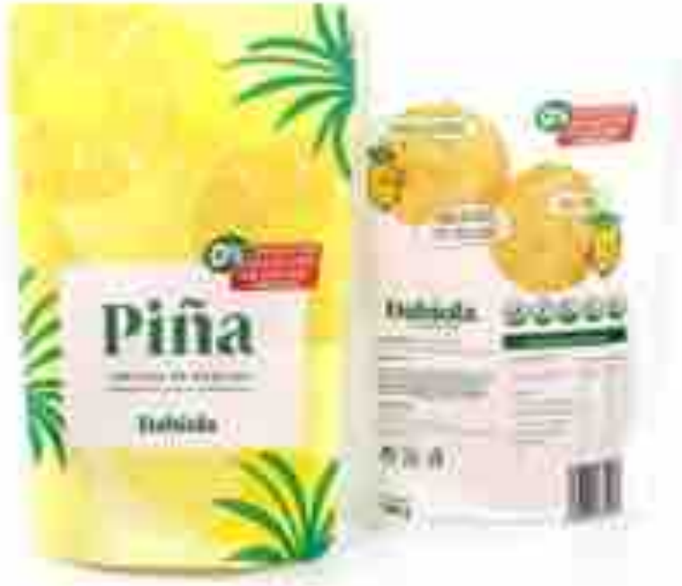
Unsweetened Dried Pineapple Dabiola Appearance: 100 grams Shelf Life: 12 months