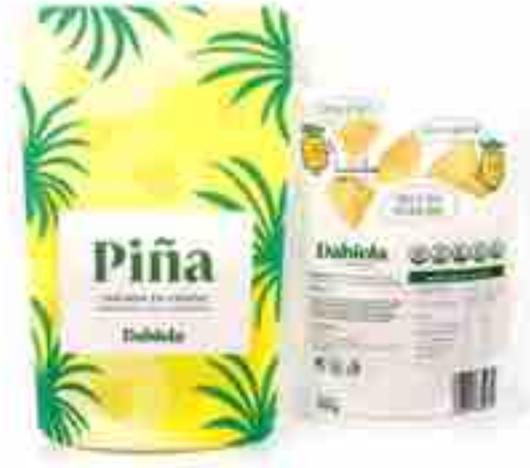
Dried Pineapple Dabiola