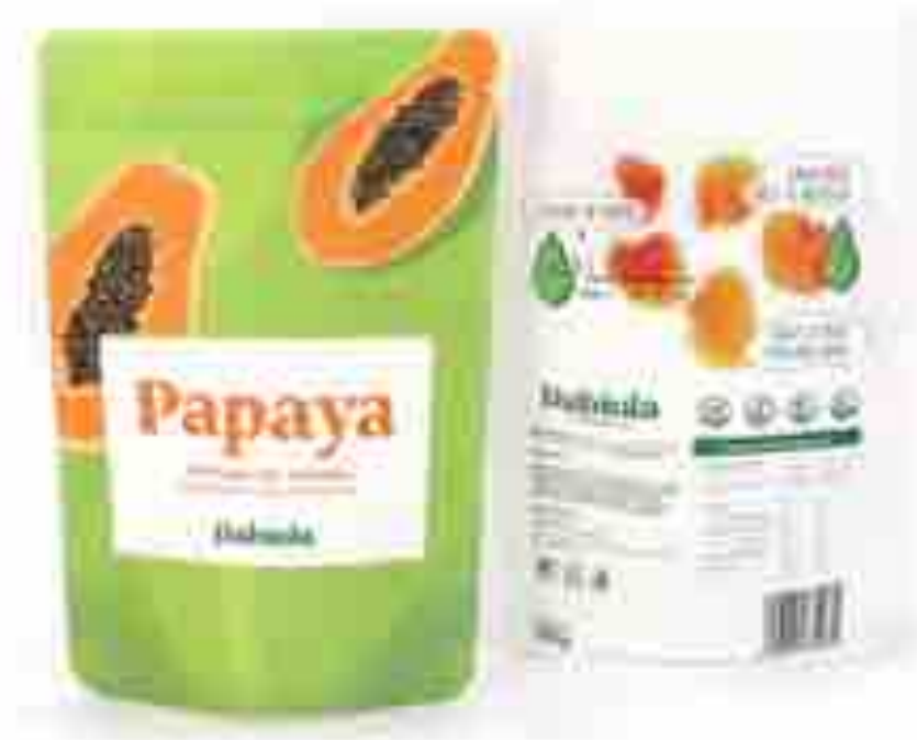
Dried Papaya Dabiola